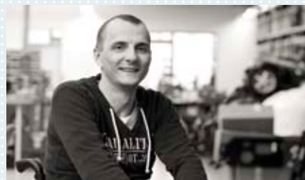
René Page 20

➔ Plus Special: German Engineering Page 26